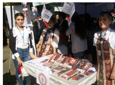
Members of the Enterprise

Subsequent to the closing of the company, the students formed their NGO called Aregak and started exploring what community project to implement within their Hayasa CSR. After looking at a number of problems, the students concluded that the most critical need for the community was the water dam. The dam is the source of water for the school and for the community. The dam was on the verge of collapse, had big cracks within the walls which allowed filth to seep through. The residents of the village were not using the water because they knew it was contaminated. Moreover, the situation called for possible landslides. In repairing the dam, the students received assistance from the community members including the Geghanush municipality for 302,000 AMD and local business for 132,940 in the form of construction material. The students commented on their work and expectations “Every time the village folks drink water, we are sure they will bless us and JAA by an old saying, ‘may you have a long life like water’”.