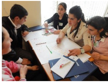
Business plan by high school students