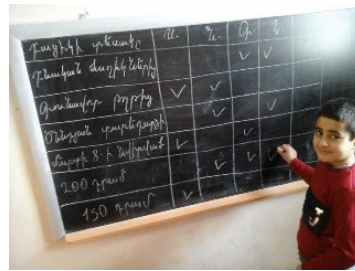
Market research by elementary school students