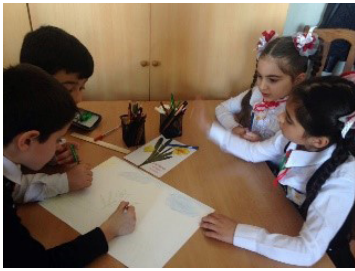
Business plan by elementary school students