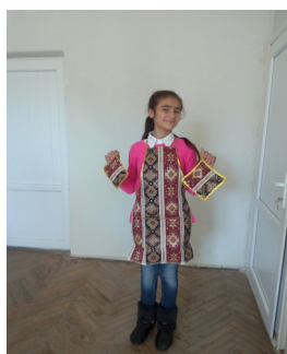
Product of the Company