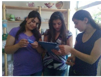
Market research by high school students