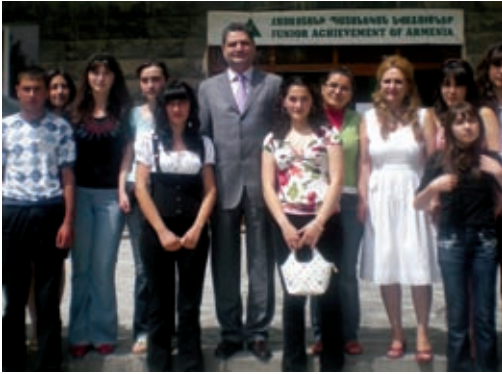
JAA students with Prime Minister Tigran Sargsyan at JAA camp